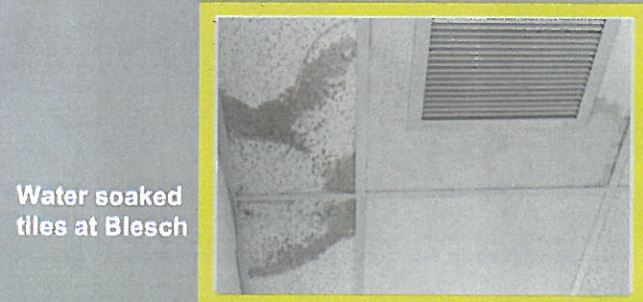
Water soaked tiles at Blesch