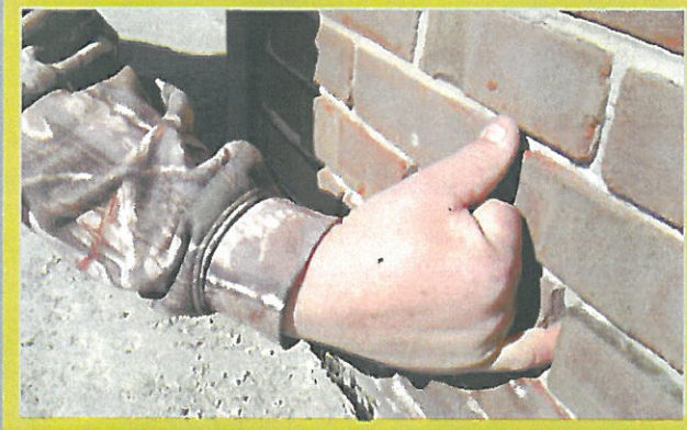
Worn tuck pointing allows a finger to fit in up to the knuckle.